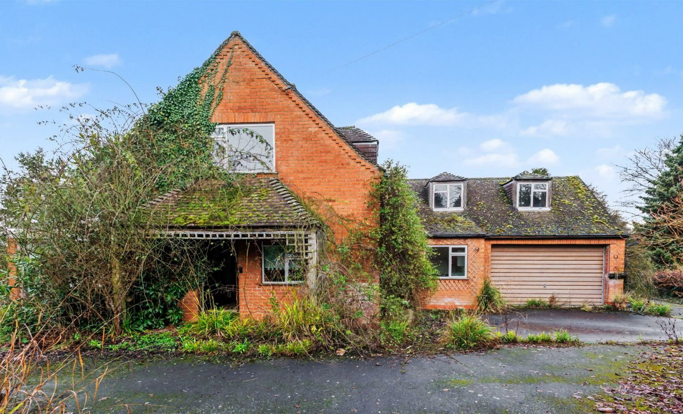
Templar House, Temple Grafton, Alcester, B49 6NS